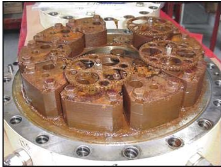
20333 Type 1 Frame 9FA Flow Divider