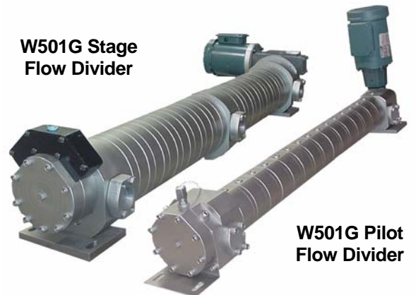
W501G Pilot Flow Divider